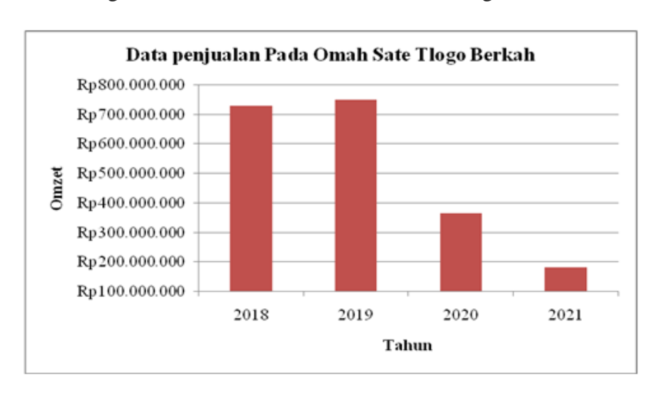
Figure 1. Sales Turnover of Omah Sate Tlogo Berkah