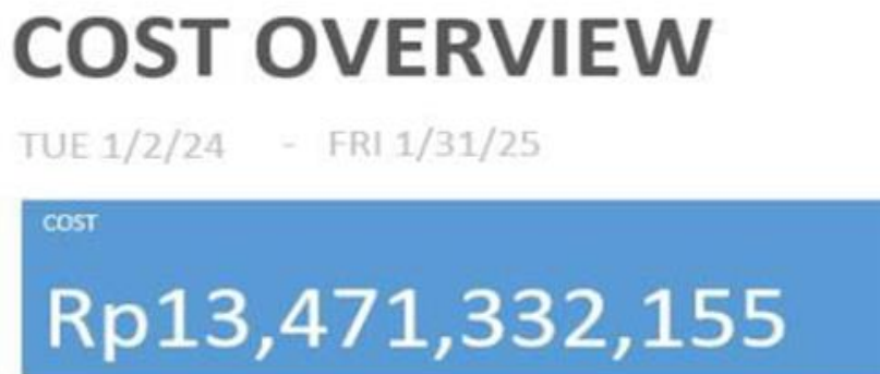
Figure 2. Total Construction Funds for construction in the region Kunjang River region, East Kalimantan

Total construction costs are the total amount of funds needed to complete a construction project, including all expenses ranging from planning, materials, labor, to other unexpected costs. Based on figure 1.3 below, the total construction funds are IDR 13,471,332,155,000. This figure is the total cost required to complete a construction project from start to finish.