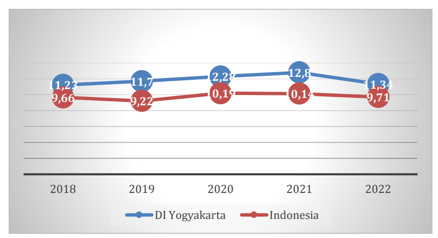
Figure 1 Poverty in Indonesia

closely linked to the shadow of poverty. Indonesia has a fluctuating poverty trend and tends to decline over several periods. The causes of poverty in Indonesia can be related to real wages, unemployment, and other macroeconomic factors (Putri & Putri, 2021). The theory put forward by Nukshe regarding the vicious circle of poverty emphasizes that the cause of poverty occurs due to the failure of a perfectly competitive market, while the failure of a perfectly competitive market will affect many macroeconomic factors.