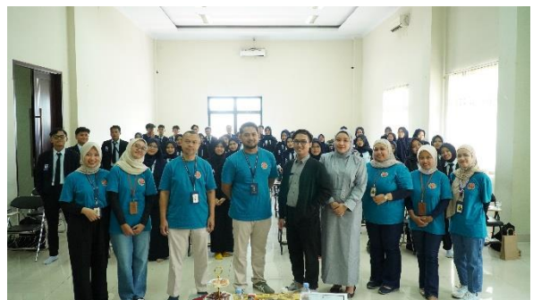
Gambar 3 Documentation with Participants

One of the biggest challenges in implementing activities is time management and accommodating in-depth discussions amidst a busy schedule. Apart from that, the complexity of the tax material requires more creative methods to ensure that all participants can follow it well. However, this activity opens up opportunities for further development, for example, by holding sustainable programs or expanding the program's reach to other campuses in Tasikmalaya and its surroundings. With a sustainable program, it is hoped that tax literacy among students can develop significantly, creating a proactive and tax-aware young generation Arfah & Muhidin, 2018).