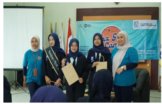
Gambar 2 Student participation