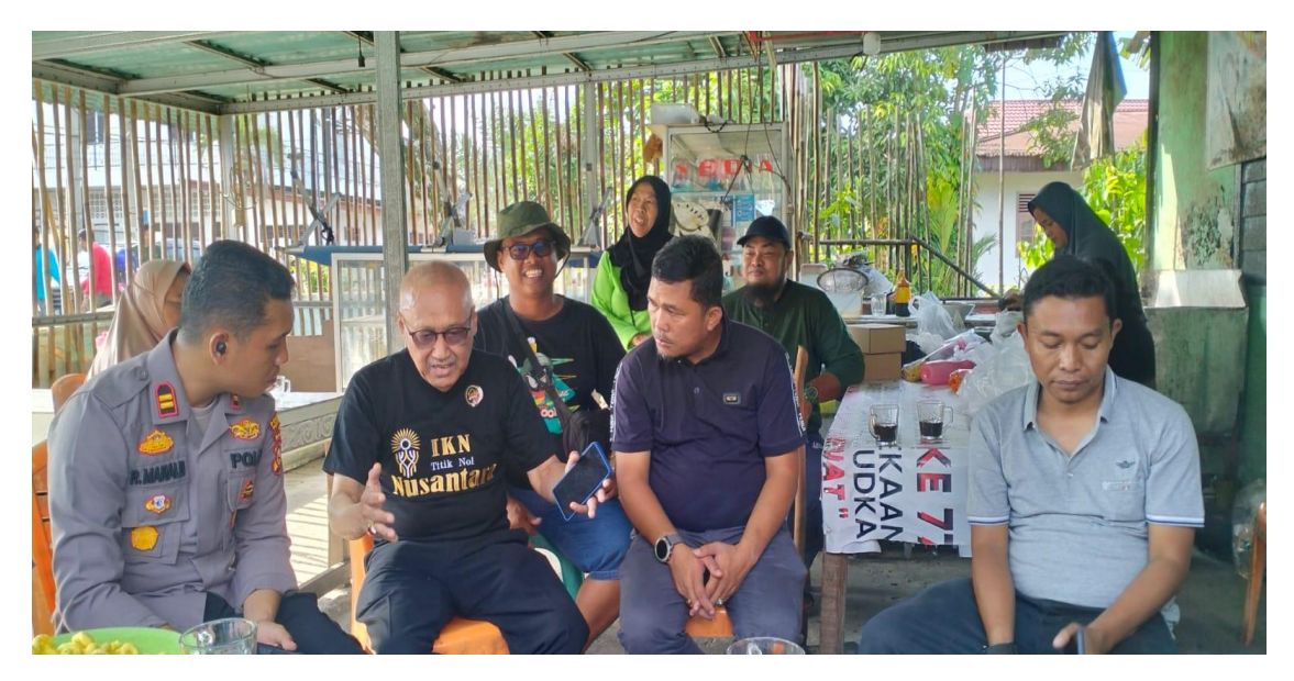
Figure 6. Discussion between the RW 08 Advisor, Police Chief, Sub-District Head, Head of Tampan District, and Commander of KODIM 031