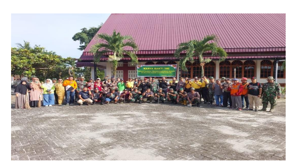
Figure 2. Group Photo Involving TNI, POLRI, the District Head, Police Chief, NGOs, and the Community of East Labuh Baru