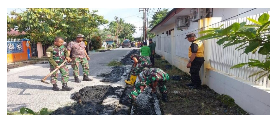
Figure 4. TNI and POLRI cleaning the drainage/canal on Arjuna Street in East Labuh Baru