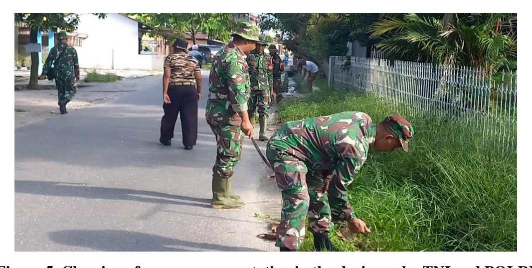
Figure 5. Cleaning of overgrown vegetation in the drainage by TNI and POLRI