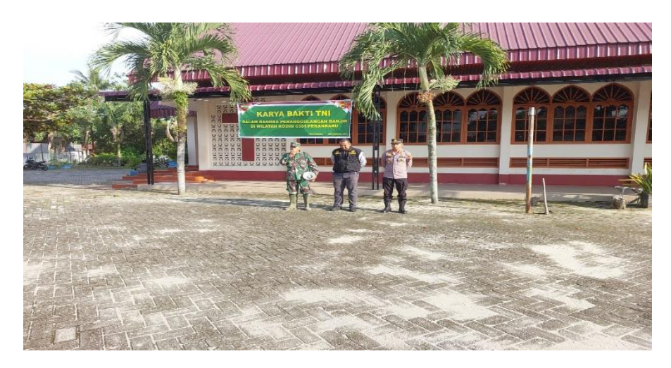
Figure 1. The Activity Officially Inaugurated by the Commander of KODIM 031 Pekanbaru, the Police Chief, and the Head of Tampan District

e. Dispose of waste using sanitation vehicles from the Public Works Department.