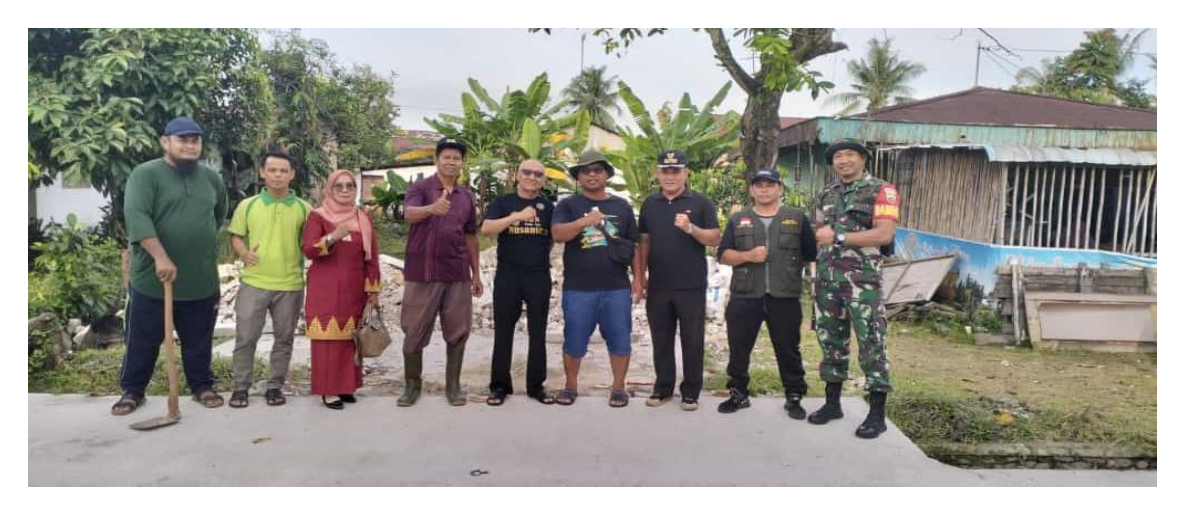
Figure 3. Group Photo Involving Head of RT 02, BABINSA (Military Area Coordinator), Head of Technical Implementation Unit, and RW 08 Advisor of East Labuh Baru