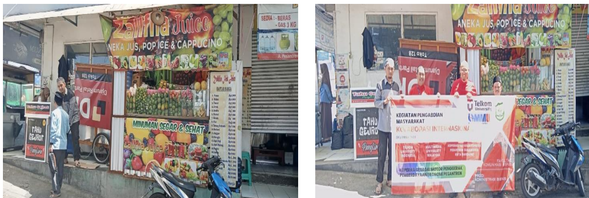
Figure 3. Penyuluhan Lapangan Unit Bisnis Pesantren Sukamiskin

The discussions that took place during the activity not only discussed questions asked by participants but also shared sessions, especially from managers and members of cooperatives at the Sukamiskin Islamic Boarding School in Bandung City v, related to good cooperative management by empowering business units that are members of the cooperative. From this it is known that the factor causing the cooperative to not develop as desired by both the management and members of the cooperative is because there are no procedures in managing (Rojak et al., 2021) the cooperative so that the management of the cooperative is still conventional. Conventional management of cooperatives in this digital era is a factor that causes difficulties for cooperatives to develop. To transform cooperative management from conventional to digital management (Jamaluddin et al., 2022), it can be started by increasing the digital literacy of cooperative administrators and members. Increasing digital literacy is an initial and important step in the transformation of cooperative management.