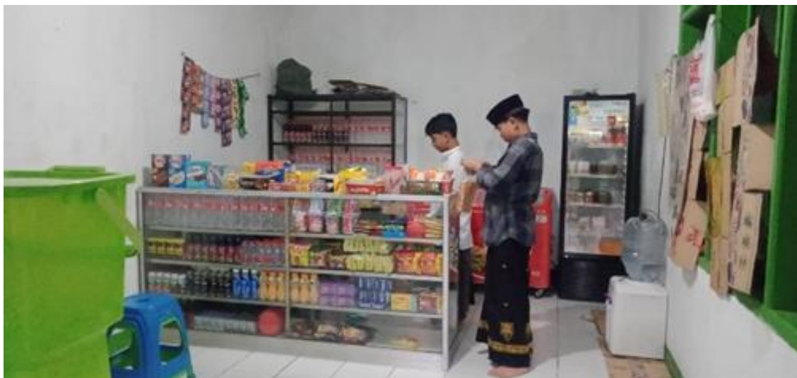
Figure 2. Unit Bisnis Penjualan Koperasi Pensantre Sukamiskin

Community service activities in the form of counseling and education regarding the management of business unit cooperatives at the Sukamasikin Islamic Boarding School have been carried out as planned. Counseling and education was carried out face to face at the cooperative business unit located at the Sukamiskin Islamic Boarding School with the target community being the cooperative administrators and business unit owners who became members of the cooperative on December 19 2023 and attended by the cooperative management and cooperative members of the Sukamiskin Islamic Boarding School (Figure 2 and 3).