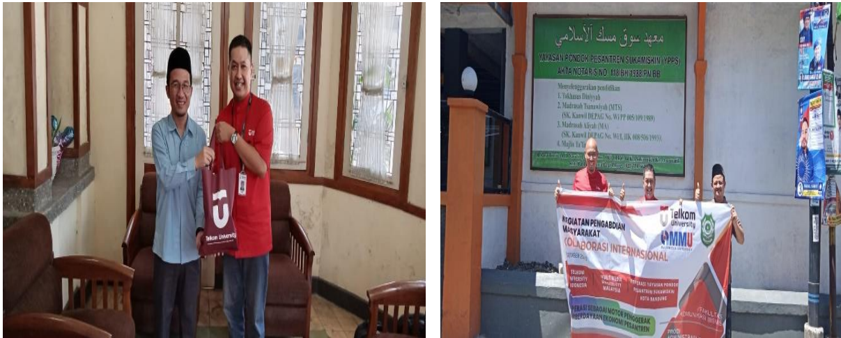
Figure 3. Pelaksanaan Pengabdian Pada Masyarakat Koperasi Pesantren Sukamiskin Kota Bandung

the governance of business units as members of cooperatives with a transformation approach from conventional management to digitalization.